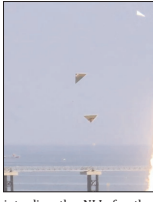
A missile being launched from a launch site.

South Korean warplanes fired three air-to-ground missiles into the sea north across the NLL in response, the South's military said. An official said the weapons used included an AGM-84H/K SLAM-ER, which is a US-made "stand-off" precision attack weapon that can fly for up to 270 km (170 miles) with a 360-kg (800-lb) warhead. The South's launches came after Yoon's office warned a "swift and firm response". President Yoon Suk-yeol noted North Korea's provocation today was an effective act of territorial encroachment by a missile