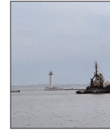
A large grain ship at sea, part of the resumed shipments.

Russia on Saturday said it was temporarily pulling out, accusing Ukraine of missing the